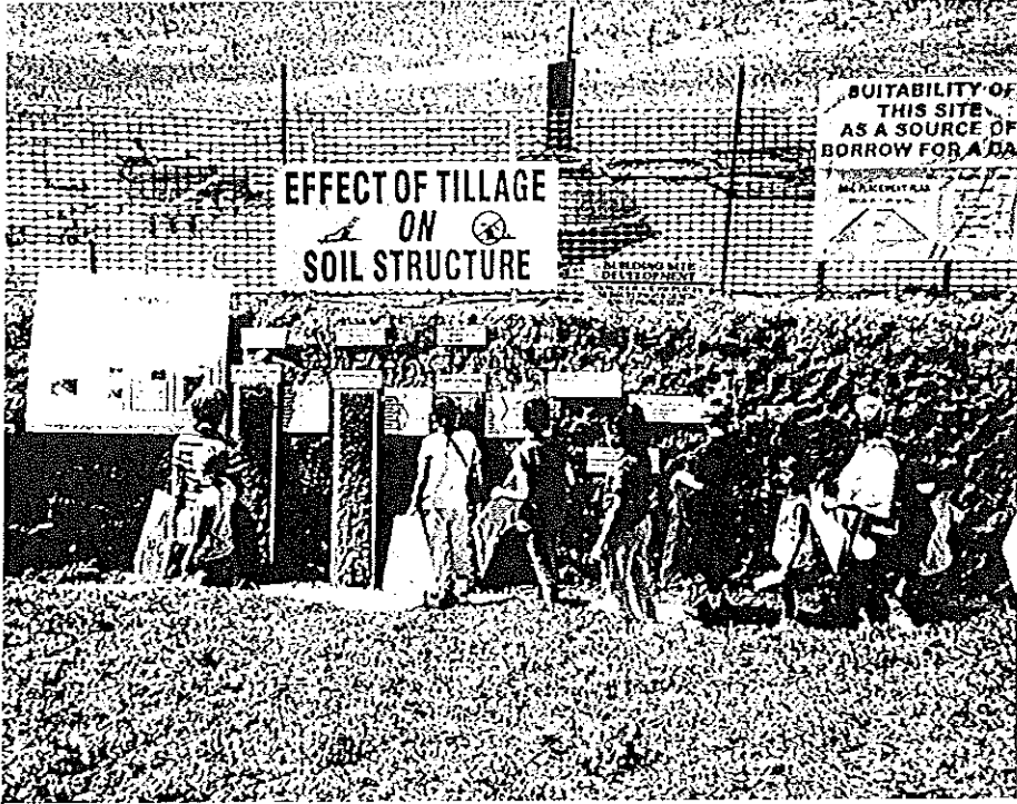
Students touring the ISCA exhibit at the Illinois Conservation Expo.