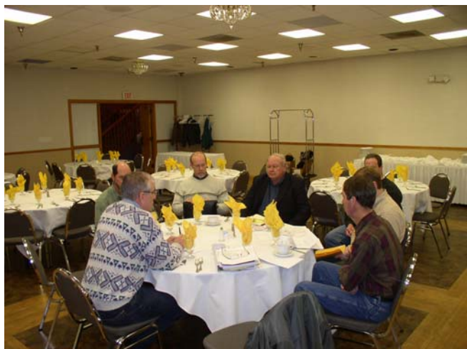
ISCA Council Meeting prior to the Annual Meeting